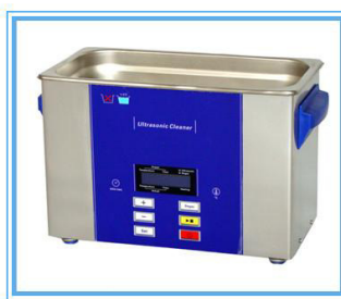
Derui ultrasonic cleaner DR-LD40 4 Litre with degas, LCD window shows and digital timer and heating