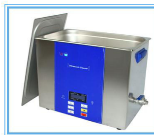
Derui ultrasonic cleaner DR-LD280 28 Litre with degas, LCD window shows and digital timer and heating