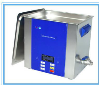
Derui ultrasonic cleaner DR-LD100 10 Litre with degas, LCD window shows and digital timer and heating