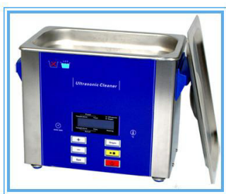
Derui ultrasonic cleaner DR-LD30 3 Litre with degas, LCD window shows and digital timer and heating