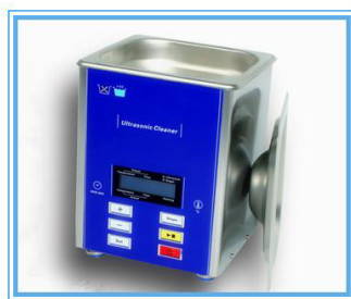
Derui ultrasonic cleaner DR-LD20 2 Litre with degas, LCD window shows and digital timer and heating