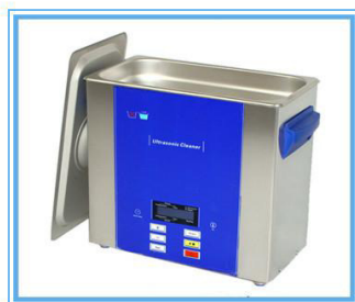
Derui ultrasonic cleaner DR-LD60 6 Litre with degas, LCD window shows and digital timer and heating