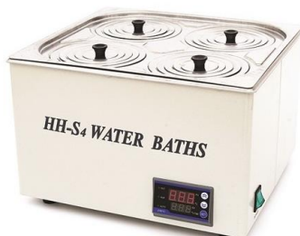
HH-S 4 HH-S 4 Thermostatic water bath