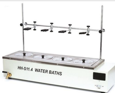
HH-S 11 、4、6、8 Single – row Thermostatic Water Bath