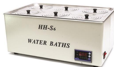
HH-S 6 HH-S 6 Thermostatic water bath