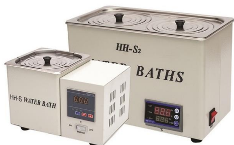
HH-S 1 、HH-S 2 HH-S 1 、HH-S 2 Thermostatic water bath

High quality stainless steel material, heat resisting and anticorrosion, operational temperature controller and bi-integral A/D converter, digital display, durable.