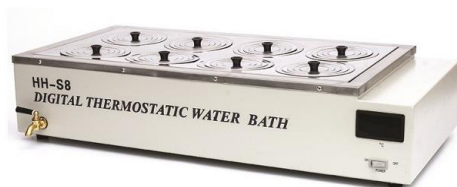
HH-S 8 HH-S 8 Thermostatic water bath